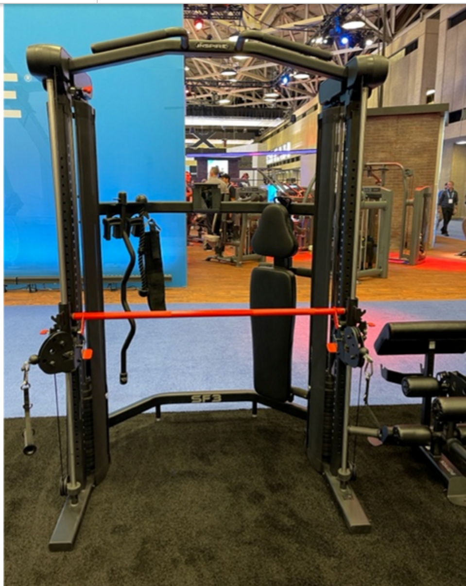
SF3 Functional Trainer at IRHSA